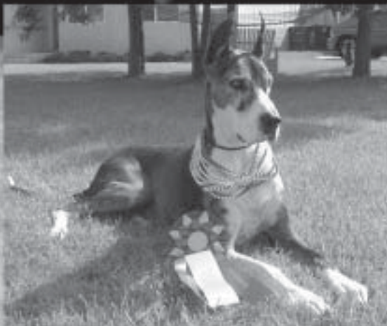
(Daneridge's Camelot x Ch. GMJ's The Zacharia P. Steele)

Not to be outdone by her Ch/Agility titled daughter, Lava... Penelope starts Agility at 8 years young!